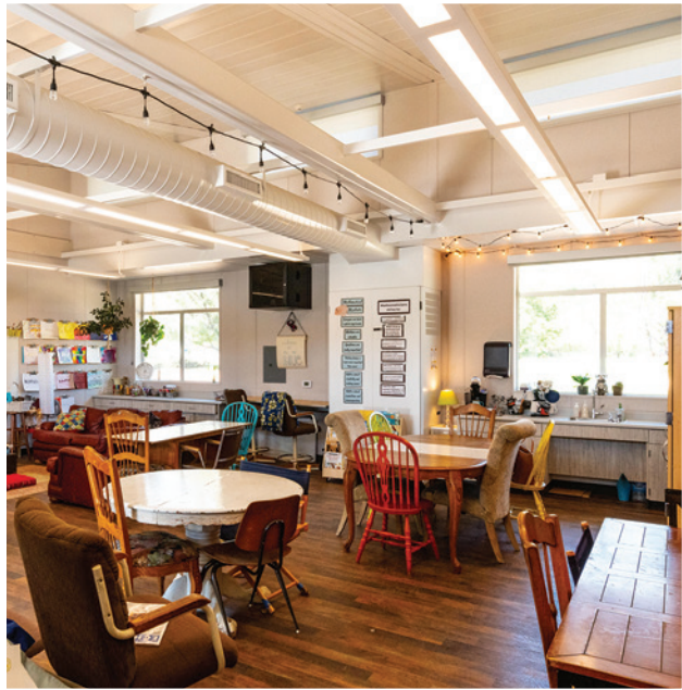
Total Square Footage – 5,760 sq ft

Owner: San Luis Coastal Unified School District Architect: RRM Design Group