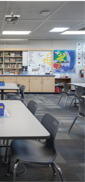
are Footage – 7,680 sq ft

The team at Enviroplex with the help of the Architect developed a building with a unique footprint which gave the appearance of a uniform building. The shape also created the central courtyard the District desired which resulted in a much more collaborative environment for the school's growing student population.