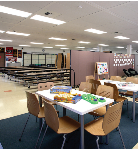
Total Square Footage – 20,800 sq ft

Located in San Jose, California, the new two-story Rocketship Los Sueños Academy built by Enviroplex represents how stakeholders carefully and purposefully sought to maximize space and dollars spent to support student learning. Situated on a tight, urban site, the 20,800-square-foot building with its back-to-back design and 8-foot-wide interior corridor synthesizes the functional requirements of the school with the population it serves. The three-coat stucco exterior enhances a strong vertical form that reduces streetscape bulk and creates a compact two-story footprint. This striking facility is energy-efficient, durable and a perfect example of what can be accomplished with limited funding on an impacted urban site while emphasizing the value of education.