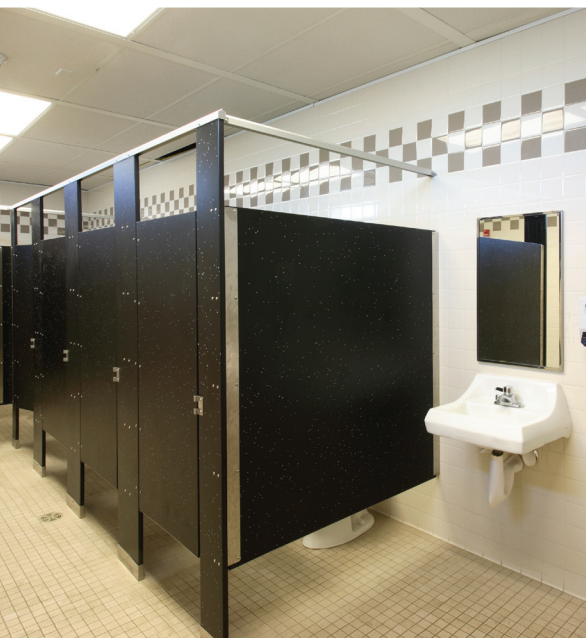
Total Square Footage – 960 sq ft

Completed in August 2010, the 960-square-foot concession/restroom building's custom-designed floor plan met all of the athletic program's requirements: multiuser boys' and girls' restrooms on one side of the building and the concession area and storage/maintenance room on the other side, stainless steel roll-up windows to service the efficiently spaced concession sales area and 5-foot front and rear overhangs for added protection from inclement weather. A site-applied three-coat stucco exterior custom-painted with Stagg High's school logo gives the building a striking, polished look.